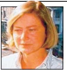
■ AWARD Kate Adie.